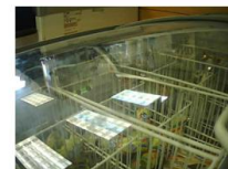
DATE : 3/2/2016 11:30:21 AM

The first application for the App is for BT's Track and Trace range of solutions.